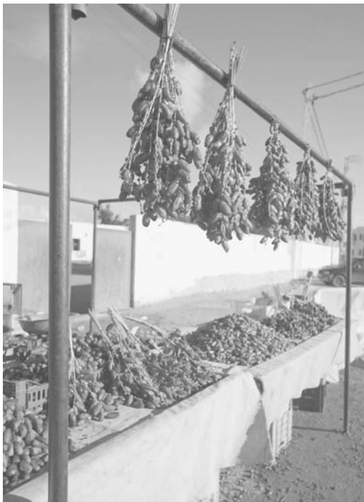
Selling dates at the market on the island of Djerba, Tunisia, Africa.